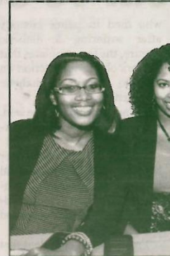
Navigators who were on hand and helping to sign-up people throughout the community.

"If we could have a larger community initiative with several churches coming together, we could have a larger impact," he said. "I'd like to see this continue and perpet-