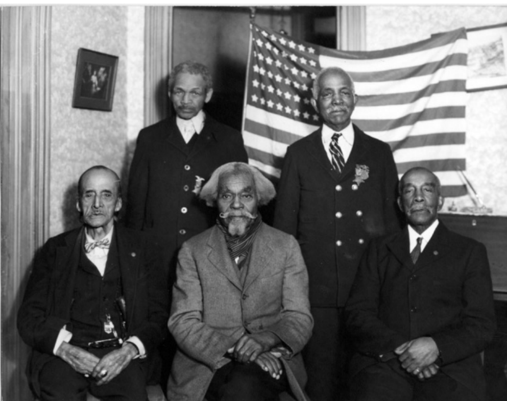
G.A.R. Post, Civil War Veterans, 1935